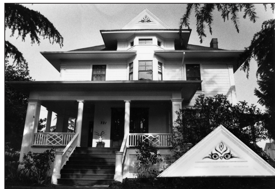
Left: Dawson House (7) Built in 1910. by the owner of the Owl Drug Store. Note the "Owl face" on the top gable.

In 2000 the National Register nomination was amended to adjust the period of significance to include the years from 1915 to 1945, thus adding single- and multi-family residences constructed in the district as infill between WWI and the end of WWII. These resources included excellent examples of Craftsman, Bungalow, Colonial Revival, Minimal Traditional, and Depression/World War II-Era Cottage styles. The Monteith District boundary was officially expanded November, 13, 2008, to include 78 properties abutting the original district that share a similar historic association and feeling.